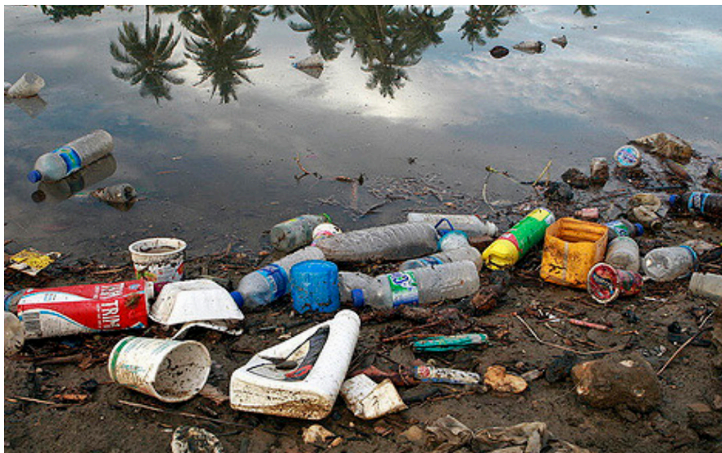
Litter on the shores of Timor-Leste. Plastic bottles and garbage waste from a nearby village wash on the shores of a river and then spill into the sea.

In Timor-Leste, there has not been any successful coordinated anti-littering campaign like we had in Australia. Littering is still something that most Timorese do not have a consciousness about and it is not uncommon for little to be dropped in the ground. There is a growing awareness of the issue and the Government has made a big effort to keep the streets of Dili clean, however at the level of individual responsibility there is not yet a social awareness about the impacts that littering can have on the environment.