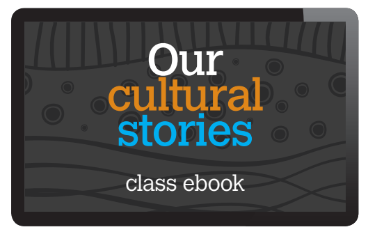
Example book cover

As a class, brainstorm what you are going to put in your book. You will need a title, pictures and text, this is called the book content. Plan how your book will look by working out what content will go on each of the pages using the content planning template below. Decide if the book will contain information collected from class discussions and be a whole-of-class book or will each student have their own page within the book.