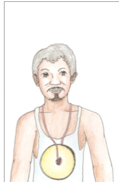
3. Belak Traditional men’s chest ornament, flat, metal and circular. Made of silver or gold, belak represents the sun.