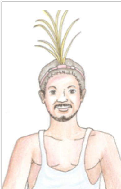
1. Mane-fulun or kabora: Head-dress made of feathers or horse’s mane hair.

Have a look at the following six pictures of some traditional items of dress that are used in ceremonies in Timor-Leste.