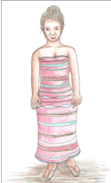
4. Tais Feto

Traditional dress for women. Often a tubular piece of material, which a women pulls onto her body. It may be worn above the breast or around the waist.