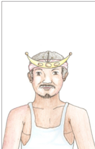
2. Kaebauk Head-dress/Crown. Made of silver or gold, kaebauk represents the moon.