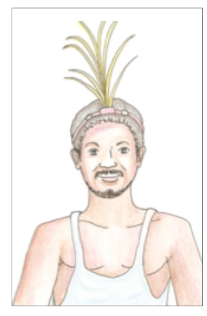
1. Mane-fulun or kabora: Head-dress made of feathers or horse's mane hair.

Have a look at the following six pictures of some traditional items of dress that are used in ceremonies in Timor-Leste.