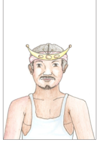
2. Kaebauk Head-dress/Crown. Made of silver or gold, kaebauk represents tthe moon.