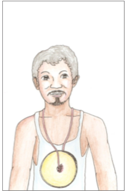
3. Belak Traditional men's chest ornament, flat, metal and circular. Made of silver or gold, belak represents the sun.